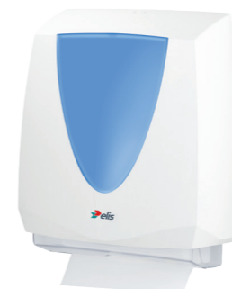
Folder Paper Dispenser