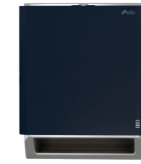
Non Touch Paper Towel Dispenser Singles Sheets