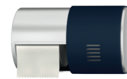
Toilet Roll Dispenser