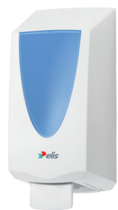
Hand Soap Dispenser (Manual) 650ml – 1,000ml