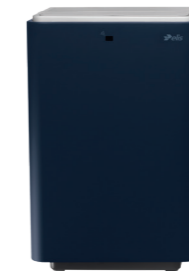
Ladycare Sanitary Disposal Unit Capacity 22 litres