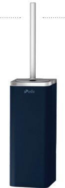
Toilet Brush Brush replaced monthly