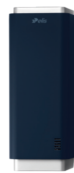
Non touch Soap Dispenser 500ml