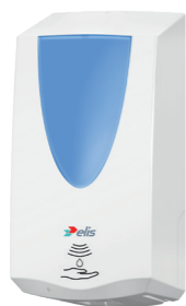
Non Touch Hand Soap Dispenser 650ml – 1,000ml