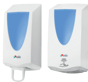
Foam Soap Dispenser (Manual) 800ml (Non touch option 800ml)