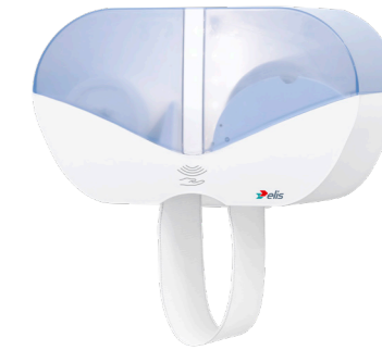
HYCARE Unit Also available in Black