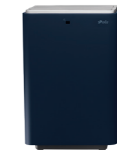
Ladycare Mini Capacity 4 litres