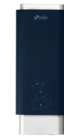
Toilet Seat Sanitiser 300mls