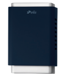
Aerosol Air Freshener Battery Powered