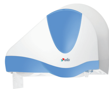
Jumbo with Reserve