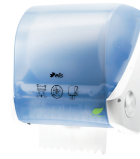
Paper Roll Dispenser Non Touch