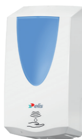
Non Touch Hand Sanitiser Dispenser 650ml – 1,000ml