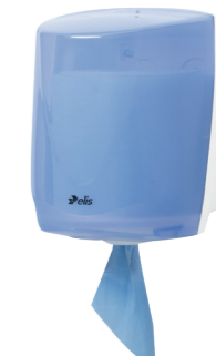
Centerfeed Paper Dispenser