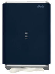
Paper Towel Dispenser Z fold Paper Towels