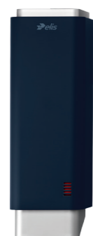
Soap Dispenser 500ml (Manual)