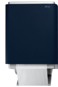
Retractable Cotton Towel Dispenser