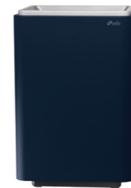
Refuse Bin 20 litre / 50 litre