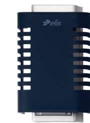
Passive Air Freshener